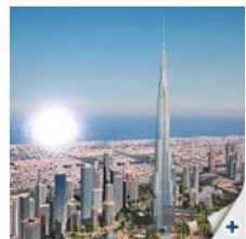
Burj Dubai (UAE)